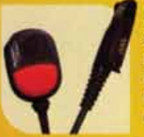
FC007 Speaker Microphone with Mini Warris Connector to suit Motorola, Simoco and other Radios