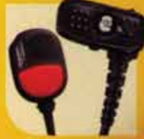
FC011 Speaker Microphone with Connector to suit Tait TP9100 Series Radios