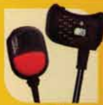
FC005 Speaker Microphone with Connector to suit Tait Orca Radio