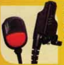
FC001 Speaker Microphone with Jedi Connector to suit Motorola Radios