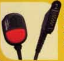
FC013 Speaker Microphone with connector to suit Tait TP8100 Series Radios