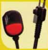
FC009 Speaker Microphone with Connector to suit Simoco SRP9100 Radio