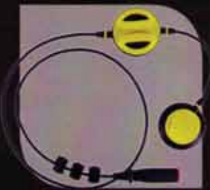
FC202 BA Accessory for use with Guardian Speaker Microphone. Attaches directly to Breathing Apparatus Mask straps.