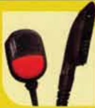
FC003 Speaker Microphone with Warris Connector to suit Motorola Radios